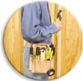
Wear comfortably—the tunnel belt loop accommodates belts up to 2¼" wide