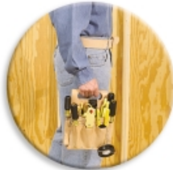
Carry easily with the quality leather, no-slip grip handle