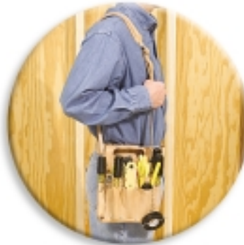
Over the shoulder styling frees your hands while keeping tools close