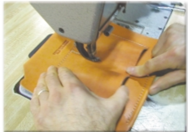
Powerful industrial sewing machines permanently lockstitch the pieces together with nylon thread

Classic highly polished top grain dyed leather. Moisture resistant, scuff resistant. Very durable. Lifetime warranty.