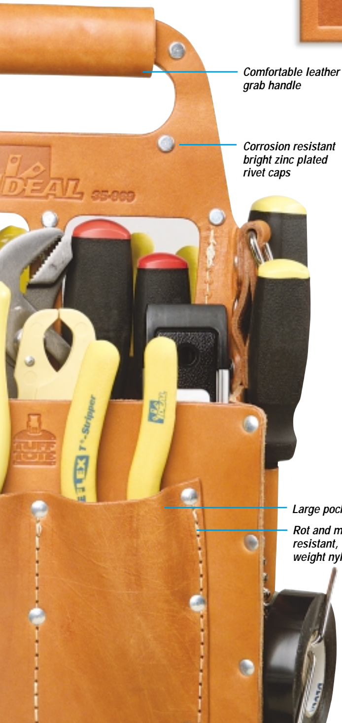
Comfortable leather grab handle

Inquire about our custom embossing service (see page 11)